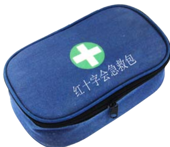
SW1132 : PORTABLE FIRST AID KIT