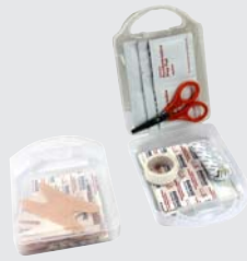
SW1410: MINI FIRST AID KIT BOX 迷你急救盒 Size:13.5×10×3cm

Qty/Ctn:120sets Meas.:41×37×33cm G.N.W.: 10/9 KGS