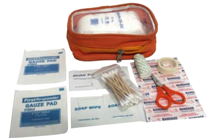
SW1120 : OUTDOOR FIRST AID KIT

Qty/Ctn:24sets Meas.:45×37×35cm G.N/W.: 8/7 KGS