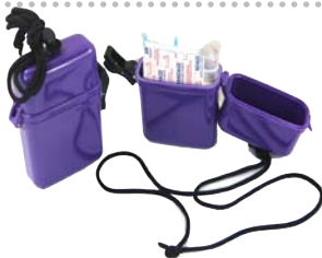
SW1417: MINI FIRST AID KIT BOX 迷你急救盒 Size:11×7.5×3.2cm

Qty/Ctn:144sets Meas.:40×37×37cm G.N.W.: 11/10 KGS