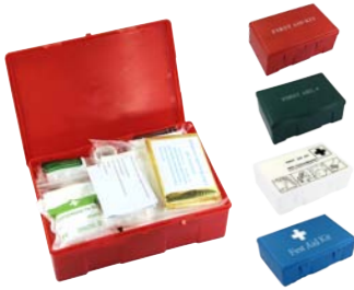
SW1403: DIN13164 FIRST AID KIT 车用DIN13164急救箱 Size:25.5×16.2×8cm