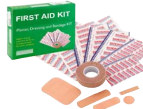
SW1419: MINI FIRST AID KIT BOX 迷你急救盒 Size:12×9×2cm

Qty/Ctn:120sets Meas.:39×32.5×37cm G.N.W.: 12/11 KGS