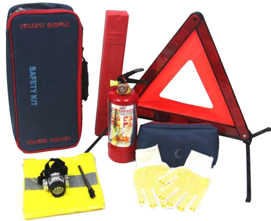
SW2156: CAR SAFETY KIT