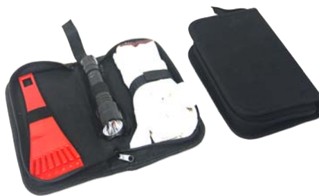
SW3004 : 3PCS CAR TOOL KIT 3件套汽车工具包 Size:21×12.5×4cm

Qty/Ctn: 24sets Meas.:41×39×41cm G.N/W.:16/15KGS