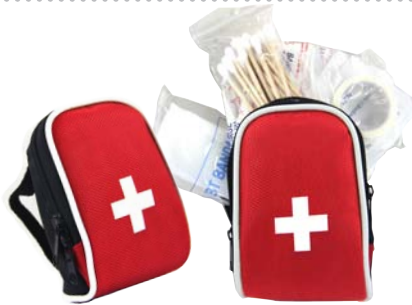
SW1335: MINI FIRST AID KIT

Qty/Ctn:50sets Meas.:46×26×26cm G.N/W.: 5/4.5 KGS