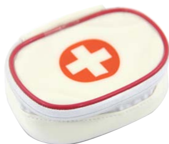
SW1133:PU FIRST AID KIT