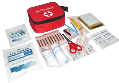
SW1103 : CAR FIRST AID KIT 车用急救包 Size:17×15.5×6cm

Qty/Ctn:72sets Meas.:45×33×46cm G.N/W.: 10/9 KGS