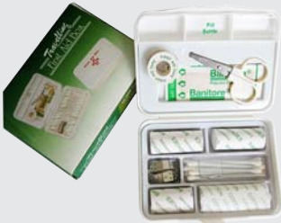
SW1409: MINI FIRST AID KIT BOX 迷你急救盒 Size:12×8×4cm