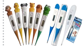
SW1420: DIGITAL THERMOMETER 数显体温计 Size:12 -14 cm length

Ctn:240sets Meas.:41×37×37cm G.N.W.: 12/11 KGS