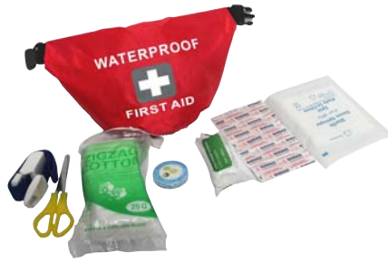
SW1116: WATERPROOF FIRST AID KIT

Qty/Ctn:48sets Meas.:46×31×48cm G.N/W.: 10/9 KGS