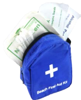
SW1128 : BEACH FIRST AID KIT