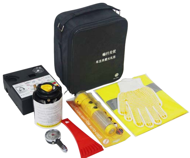
SW2104: CAR EMERGENCY KIT