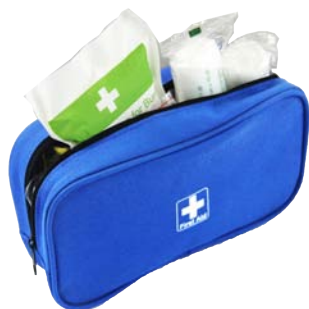
SW1127 : MOTORCYCLE FIRST AID KIT