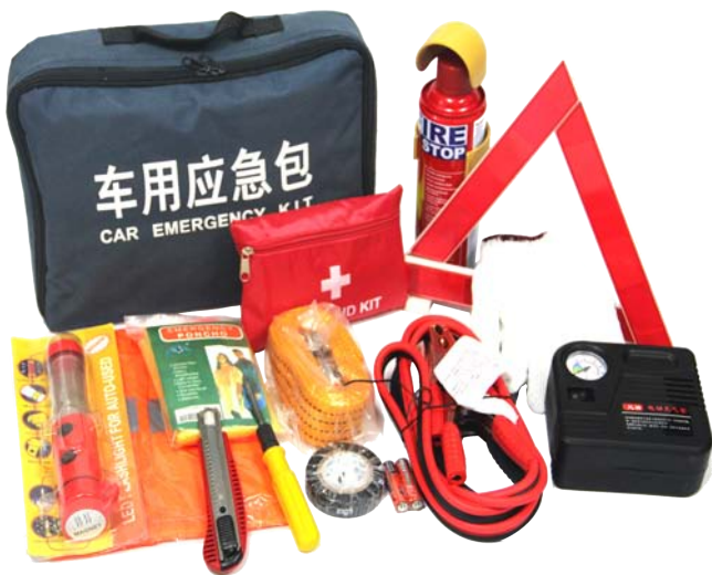
SW2114: CAR EMERGENCY KIT 汽车应急包 Size:35×23.5×8cm