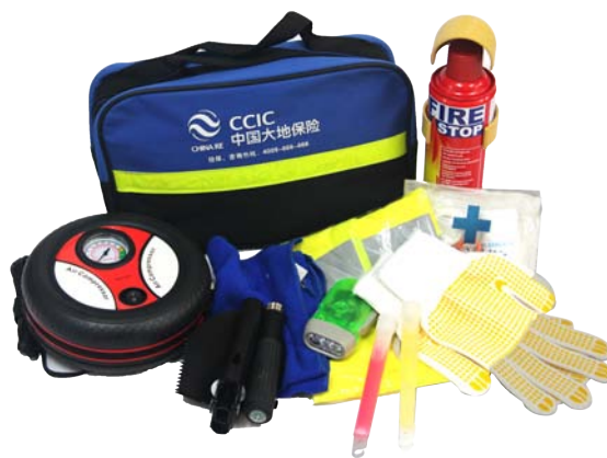
SW2159: CAR EMERGENCY KIT

Qty/Ctn: 8sets Meas.:35×35×32cm G.N/W.:17/16KGS