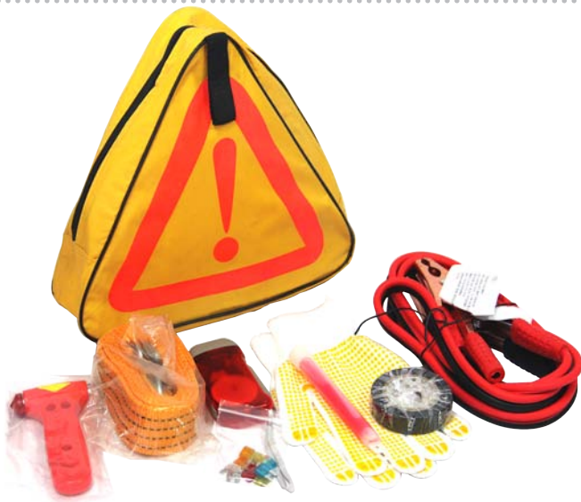
SW2112: CAR EMERGENCY KIT 汽车应急包 Size:29×8×26cm