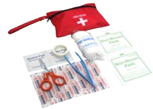
SW1315: MINI FIRST AID KIT

Qty/Ctn:120sets Meas.:35×24.5×24cm G.N/W.: 5/4.5 KGS