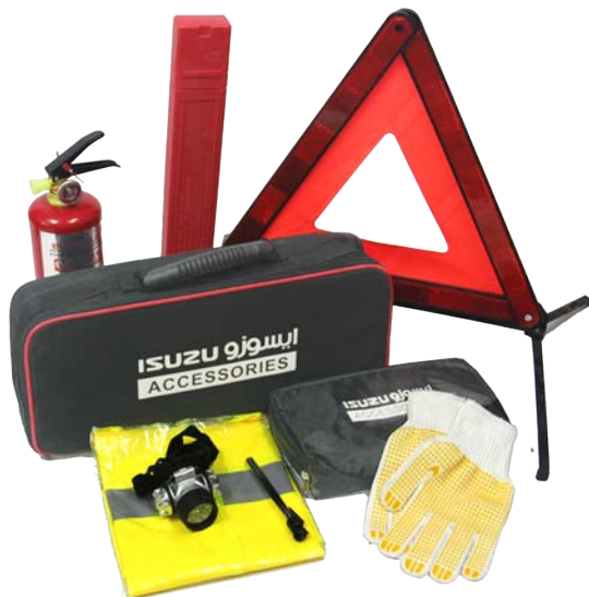
SW2102: CAR EMERGENCY KIT

Qty/Ctn: 8sets Meas.:45×37×41cm G.N/W.:19/18KGS