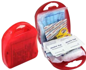
SW1413: MINI FIRST AID KIT BOX 迷你急救盒 Size:13×10.5×3cm

Qty/Ctn:144sets Meas.:37×32.5×37cm G.N.W.: 11/10 KGS