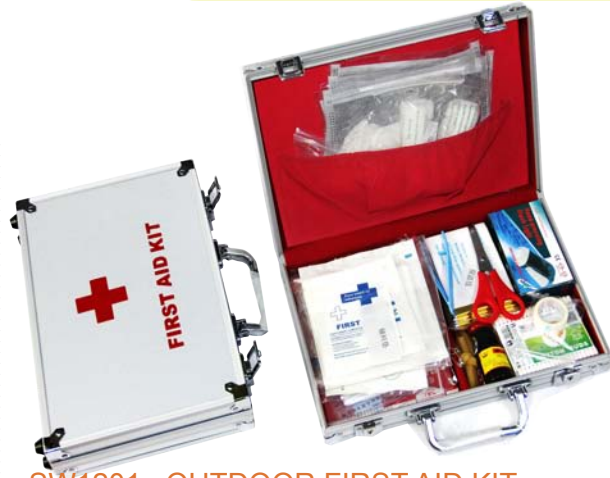
SW1201 : OUTDOOR FIRST AID KIT

Qty/Ctn: 6sets Meas.:64×43×35cm G.N/W.:12/11KGS