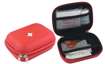
SW1316: EVA FIRST AID KIT

Qty/Ctn:40sets Meas.:56×41×31cm G.N/W.: 12/11KGS