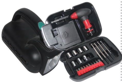
SW3003: 24PCS TORCH TOOL KIT 24件套轮胎形工具箱 Size:19×12×10cm

Qty/Ctn: 36sets Meas.:31×30×23cm G.N/W.:10/9.5KGS