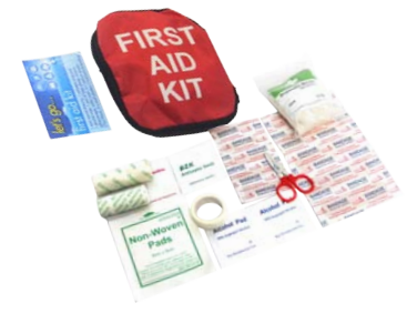
SW1237: MINI/OUTDOOR FIRST AID KIT

Qty/Ctn:60sets Meas.:37.5×21×27cm G.N/W.: 6/5 KGS