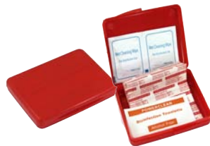
SW1414: MINI FIRST AID KIT BOX 迷你急救盒 Size:11×9×2cm

Qty/Ctn:144sets Meas.:43×37×40cm G.N.W.: 11/10 KGS