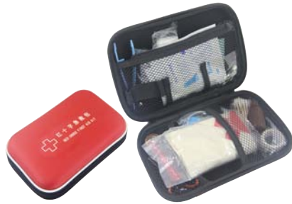
SW1311: EVA BOX FIRST AID KIT