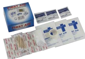
SW1418: MINI FIRST AID KIT BOX 迷你急救盒 Size:10.5×9×3.8cm

Qty/Ctn:120sets Meas.:34×33×31cm G.N.W.: 11/10 KGS