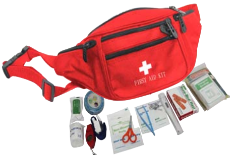
SW1115: TRAVEL FIRST AID KIT