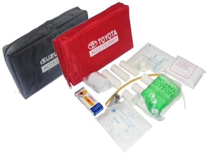
SW1102 : CAR FIRST AID KIT 车用急救包 Size:25×14×5cm