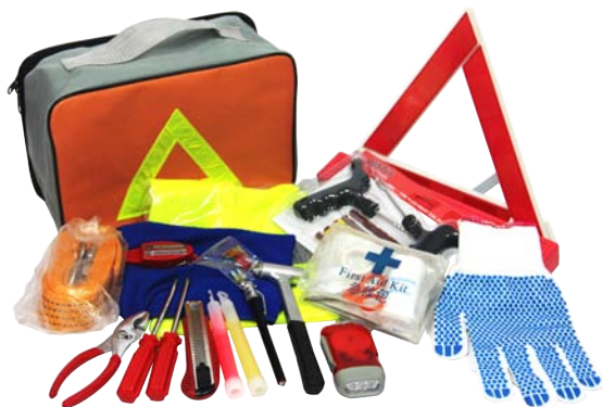
SW2158: CAR EMERGENCY KIT

Qty/Ctn: 8sets Meas.:35×34×38cm G.N/W.:17/16KGS