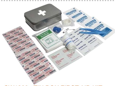
SW1203 : TIN BOX FIRST AID KIT

Qty/Ctn:96sets Meas.:53×31×37cm G.N/W.: 12/11 KGS