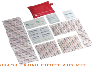
SW1121: MINI FIRST AID KIT

Qty/Ctn:100sets Meas.:56×42×32cm G.N/W.: 10/11 KGS