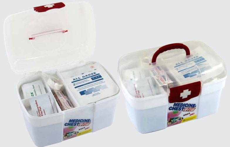
SW1429: HOME FIRST AID KIT

Qty/Ctn:12sets Meas.:44×30×41.5cm G.N/W.: 12/11KGS