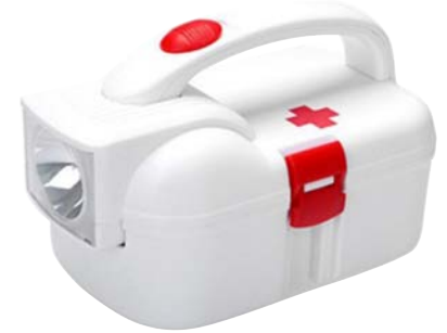
SW1405 : TORCH FIRST AID KIT 手电筒急救箱 Size:19.7×12.7×13.5cm

Qty/Ctn:24sets Meas.:45×23×43cm G.N/W.: 12/11 KGS