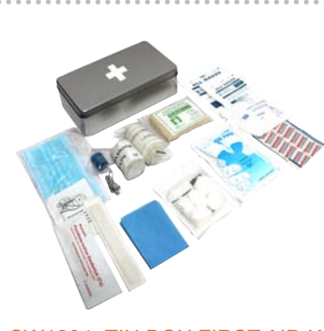
SW1204 :TIN BOX FIRST AID KIT

Qty/Ctn:60sets Meas.:45×40.5×25cm G.N/W.: 12/11 KGS