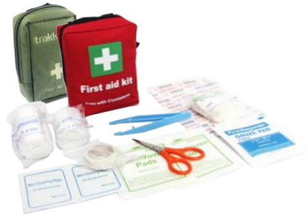
SW1238 : OUTDOOR FIRST AID KIT 户外急救包 Size:12×8.5×4cm

Qty/Ctn:30sets Meas.:44.5×26×46cm G.N/W.: 6/5.5 KGS