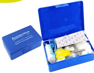
SW1404: CAR FIRST AID KIT 车用急救盒 Size:21.5×14×5.5cm

Qty/Ctn:12sets Meas.:49×27×33.5cm G.N/W.: 16/15KGS