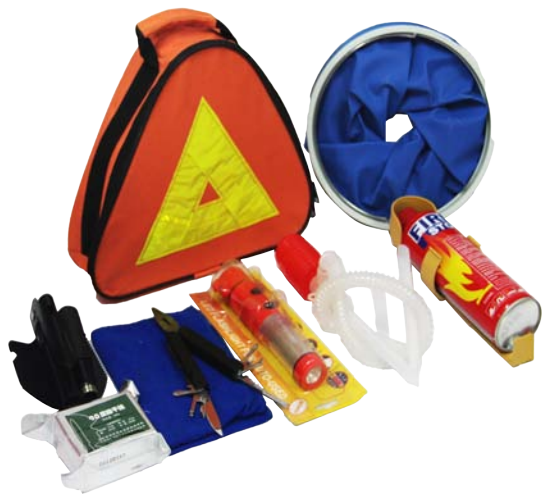
SW2110: CAR EMERGENCY KIT 汽车应急包 Size:32×7.5×28cm