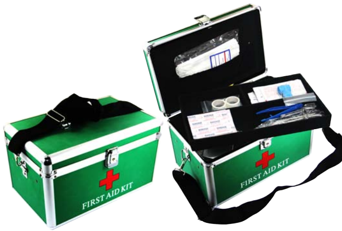
SW1259 : MULTIFUNCTION FIRST AID KIT