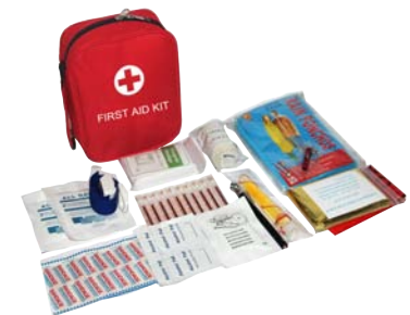
SW1105 : CAR FIRST AID KIT 车用急救包 Size:20×16×7cm

Qty/Ctn:72sets Meas.:51×36×46cm G.N/W.: 17/16 KGS