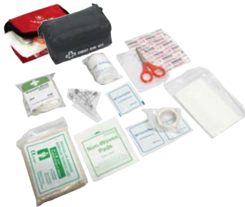
SW1319: MINI FIRST AID KIT

Qty/Ctn:250sets Meas.:51×36×46.5cm G.N/W.: 13.5/12.5 KGS