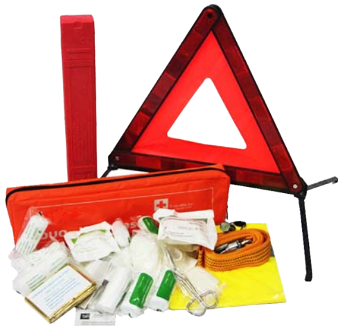
SW2101 : DIN13164 EMERGENCY KIT