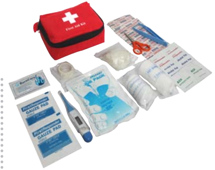
SW1301 : TRAVEL FIRST AID KIT 旅行急救包 Size:15×11×5cm

Qty/Ctn:100sets Meas.:50×28×44cm G.N/W.: 11/10 KGS