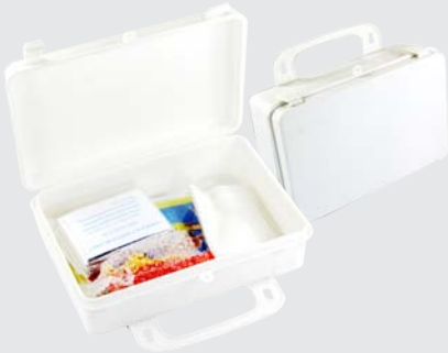
SW1406: HANDBOX FIRST AID KIT 手提箱急救盒 SizeA:20×12×7.5cm SizeB:25.5×17.5×8.5cm

Qty/Ctn:12sets Meas.:42×42×29cm G.N/W.: 10/9 KGS