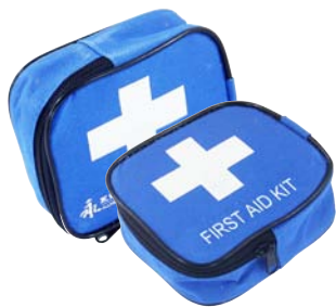
SW1126 : CAR/MINI FIRST AID KIT