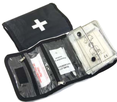
SW1136: POCKET FIRST AID KIT