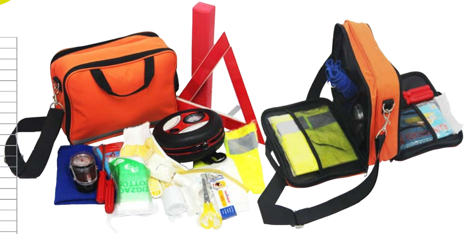
SW2154: SHOULDER BAG EMERGENCY KIT