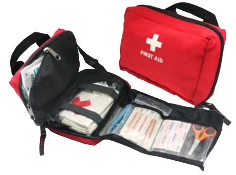
SW1117: OUTDOOR FIRST AID KIT

Qty/Ctn:24sets Meas.:49×29×46cm G.N/W.: 8/7KGS