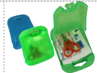
SW1416: MINI FIRST AID KIT BOX 迷你急救盒 Size:13×9×3cm

Qty/Ctn:120sets Meas.:41×37×33cm G.N.W.: 8/7 KGS