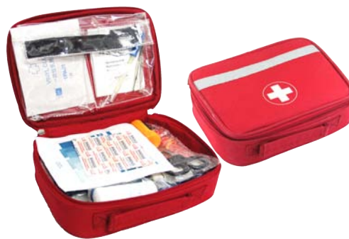
SW1129 : HOME FIRST AID KIT

Qty/Ctn:100sets Meas.:56×42×32cm G.N/W.: 11/10 KGS