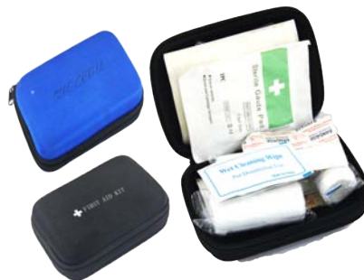
SW1309: MINI EVA FIRST AID KIT

Qty/Ctn:12sets Meas.:43×26×41cm G.N/W.: 12/11 KGS