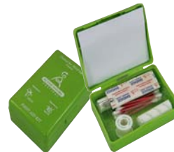
SW1415: MINI FIRST AID KIT BOX 迷你急救盒 Size:12×8×4cm

Qty/Ctn:120sets Meas.:41×23×37cm G.N.W.: 10/9 KGS