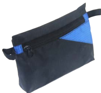
SW1138 : OUTDOOR FIRST AID KIT