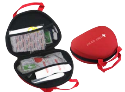
SW1310: EVA FIRST AID KIT

Qty/Ctn:48sets Meas.:41×31×31cm G.N/W.: 8/7KGS