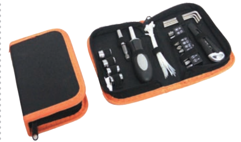
SW3425: 32PCS TOOL KIT 24件套工具包 Size:15×9.2×3.2cm

Qty/Ctn: 30sets Meas.:33.5×32.5×29cm G.N/W.:15/14KGS