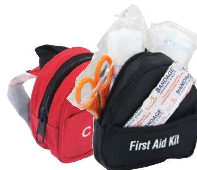
SW1137: MINI BACKPACK FIRST AID KIT