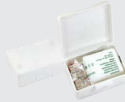
SW1411: MINI FIRST AID KIT BOX 迷你急救盒 Size:15.5×10×5.5cm

Qty/Ctn:144sets Meas.:41×37×41.5cm G.N.W.: 11/10 KGS