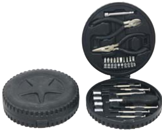
SW3001 : 24PCS TOOL KIT 24件套轮胎形工具箱 Size:17×17×4.5cm