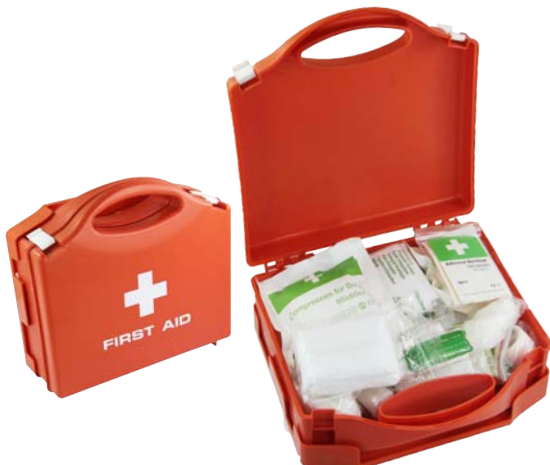
SW1402: FIRST AID KIT WITH PLASTIC BOX

Qty/Ctn:10sets Meas.:44×27.5×51cm G.N/W.: 12/11 KGS