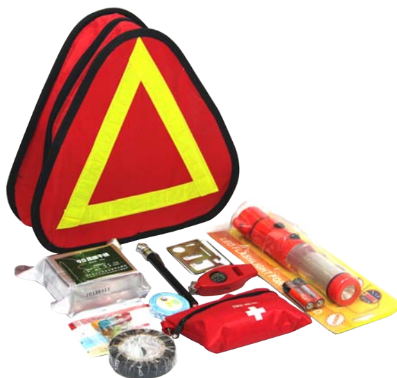
SW2113: CAR EMERGENCY KIT 汽车应急包 Size:30×8.5×27cm