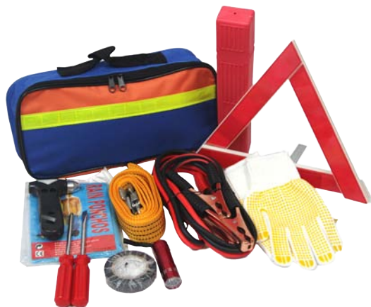
SW2160: CAR EMERGENCY KIT