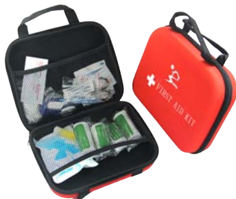
SW1303: FACTORY FIRST AID KIT

Qty/Ctn:48sets Meas.:49×32×35.5cm G.N/W.: 13/12 KGS