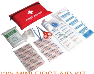
SW1320: MINI FIRST AID KIT