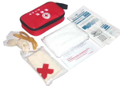
SW1104 : REDCROSS FIRST AID KIT 红十字急救包 Size:19.5×12.5×4cm

Qty/Ctn:30sets Meas.:52×32×31cm G.N/W.: 11/10 KGS