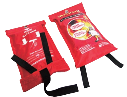
SW4001 : FIRE BLANKET 1米灭火毯 Size:28×11×4cm

Qty/Ctn: 30sets Meas.:41×22×38.5cm G.N/W.:11/10KGS