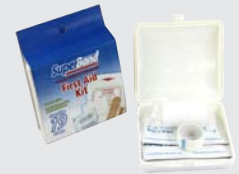
SW1412: MINI FIRST AID KIT BOX 迷你急救盒 Size:10.5×9×3cm

Qty/Ctn:48sets Meas.:32×42×31cm G.N.W.: 8/7 KGS