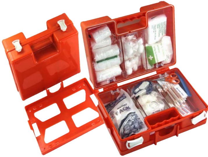
SW1401 : FACTORY/SCHOOL/HOME FIRST AID KIT