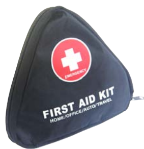
SW1214 : TRIANGULAR FIRST AID KIT