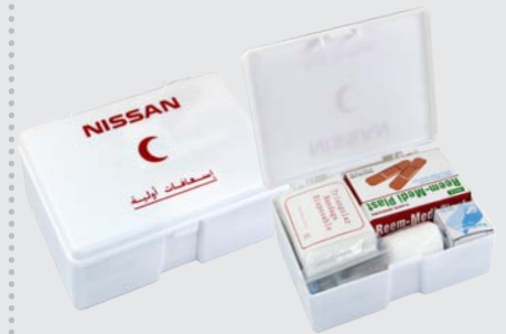
SW1408 : CAR FIRST AID KIT 车用急救盒 Size: 18.5×12×5.5cm

Qty/Ctn:24sets Meas.:57×26×34cm G.N/W.: 11/10 KGS