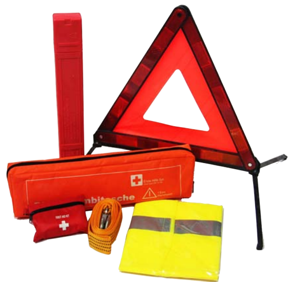
SW2143: CAR EMERGENCY KIT