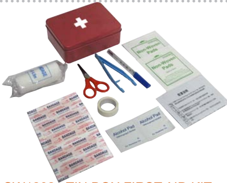
SW1202 : TIN BOX FIRST AID KIT

Qty/Ctn: 12sets Meas.:39×31×41cm G.N/W.:12/11KGS