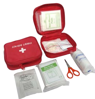
SW1119 : CAR FIRST AID KIT