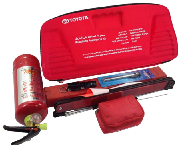
SW2106: EVA BOX EMERGENCY KIT