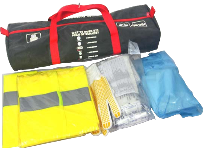
SW2157: DIN13164 EMERGENCY KIT

Qty/Ctn: 12sets Meas.:45×34×25cm G.N/W.:12/11KGS