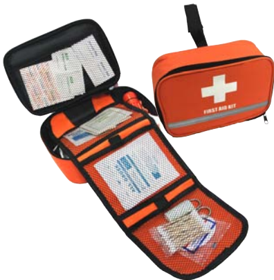
SW1134 : OUTDOOR FIRST AID KIT

Qty/Ctn:36sets Meas.:37×34×36cm G.N/W.: 10.5/9.5 KGS