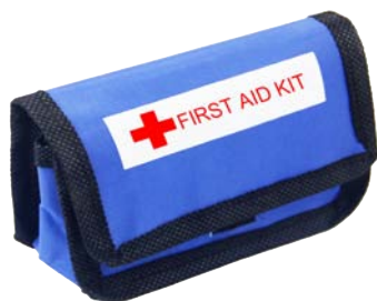
SW1131: MINI FIRST AID KIT