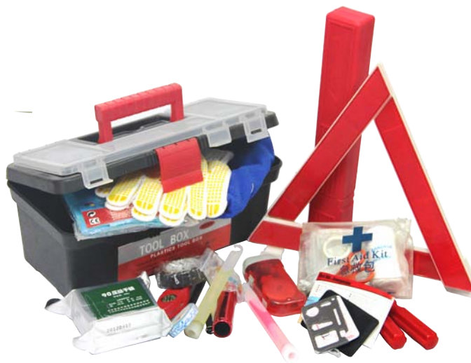
SW2115: CAR EMERGENCY KIT 汽车应急包 Size:32×16×13.5cm