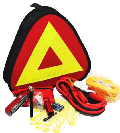
SW2111: CAR EMERGENCY KIT 汽车应急包 Size:35×7×33cm