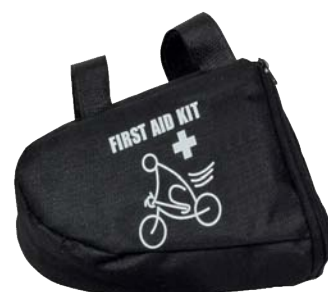
SW1139: BICYCLE FIRST AID KIT