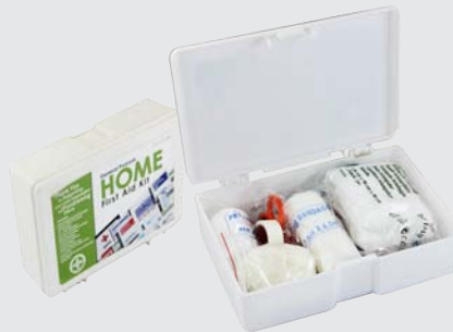
SW1407 : HOME FIRST AID KIT 家用急救盒 Size: 18.5×12.5×5.5cm

B:Qty/Ctn:100sets Meas.:53.5×52×35cm G.N/W.: 11/10 KGS