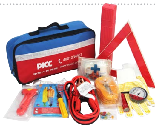
SW2161: CAR EMERGENCY KIT