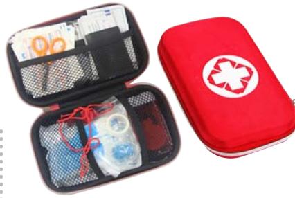
SW1302: EVA FIRST AID KIT

Qty/Ctn:24sets Meas.:47.5×24×46cm G.N/W.: 9/8.5KGS