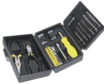
SW3002 : 24PCS TOOL KIT 24件套工具箱 Size:15×10×5.5cm

Qty/Ctn: 24sets Meas.:36×31×36cm G.N/W.:17/16KGS